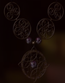
MIRALKI'S AMULET OF MARA

The conditions for this are: You have not already wore another one (K04 have not started), early flirt on, Erik is your follower, K03 higher or equal to 40 and Kaidan/Erik story (KNPC Erik) higher or equal to 20 (Kaidan/Erik has spoken at least twice and you have spoken to Erik at least once).